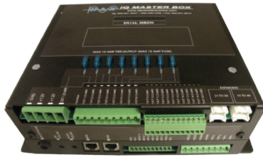
IQ MASTER AMPLIFIER/