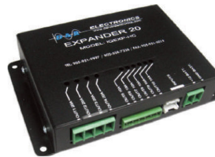
IQEXP-LC LOW CURRENT