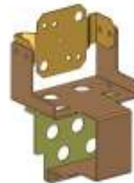
DCRS 110 Mounted With 935-0066A Adapter Bracket