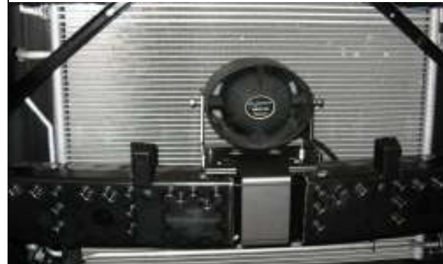
DCRS 100 Mounted