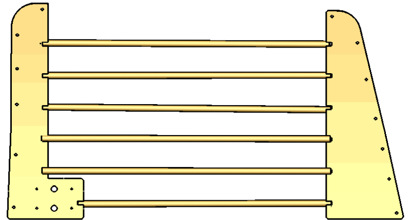
837-0422A WB PS